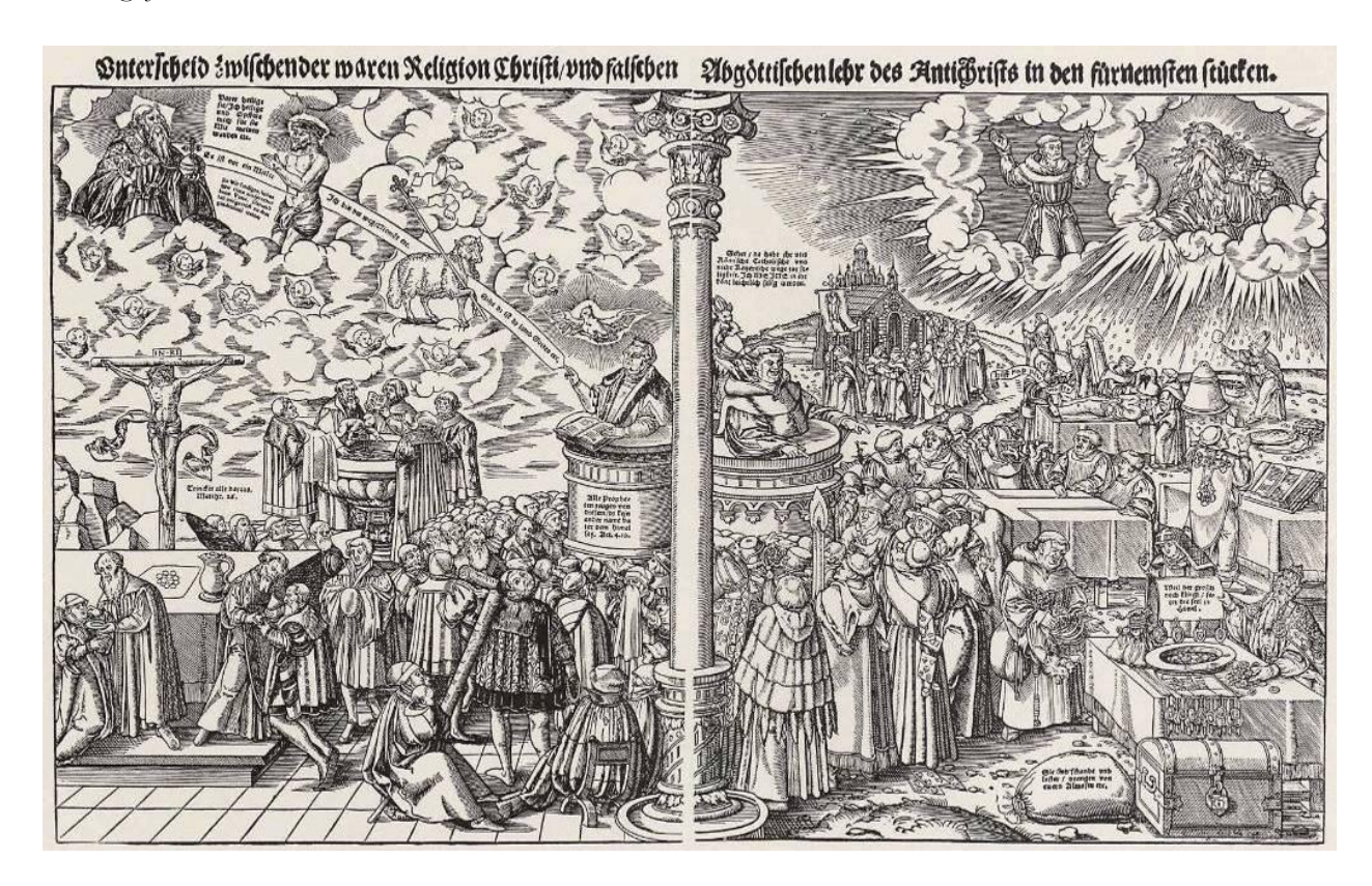
Image A: Lucas Cranach the Younger: The Difference Between the True Religion of Christ and the False, Idolatrous Teaching of Antichrist.